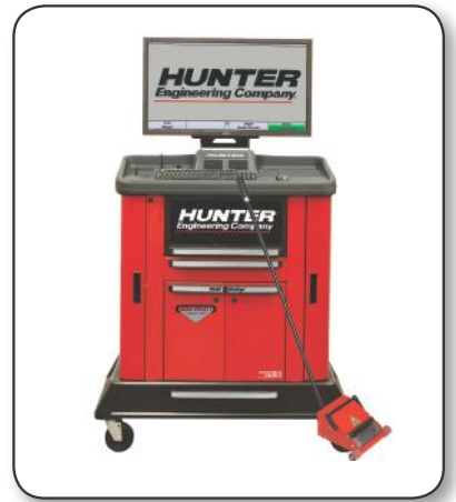
For combination light/heavy duty systems only