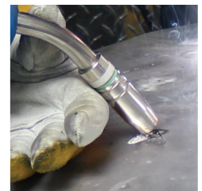
0.8mm Aluminum Hood