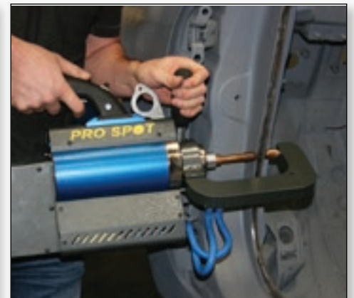
Spot welding of quarter panel using C-Arm