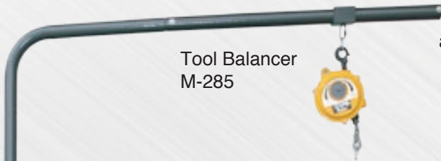
Tool Balancer M-285