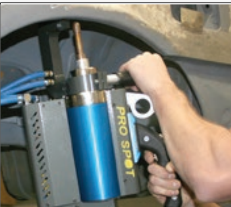
Welding with the Wheel House Arm makes it possible to weld in the most difficult areas.