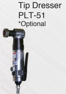
Tip Dresser PLT-51 *Optional