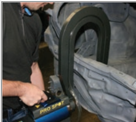
For deeper needs use the Pro Spot extension U-Arms (508mm - 600mm). They are self aligning and quick to install.