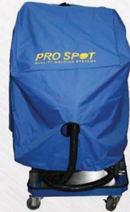
Weld Cover 80-0001