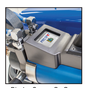
Display Screen On Gun

High Pressure Gun Standard - Squeeze Force Pressure is capable of delivering over 1000 lbs. of squeeze force, and meets or exceeds all OEM requirements.