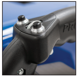
Scroll Wheel For Quick Program Control