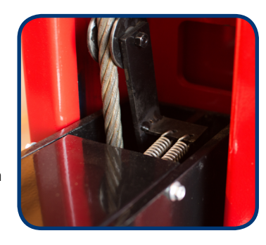
TIME TESTED CABLE DRIVE

These lifts feature a heavy-duty cylinder for optimal performance and minimal maintenance, durable non-skid louvered approach ramps, and built-in runway rail system provides versatility to add convenience options like rolling jacks and sliding oil drain pan (Sold Separately). Available in alignment and flat deck models and 3 lengths to accommodate wheelbases from 244.5" - 318.625"