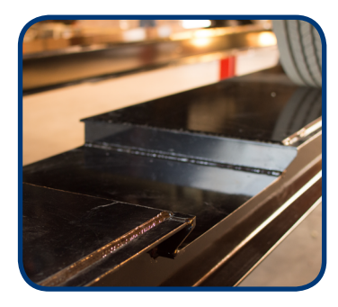
ALIGNMENT AND FLAT DECK AVAILABLE